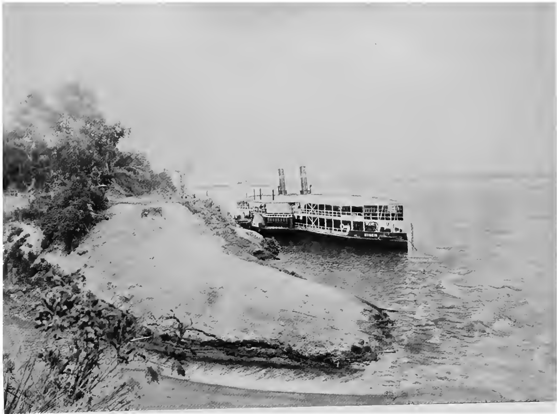
At Bhamo, Upper Burmah, showing Irrawaddy Flotilla Co.'s Steamer